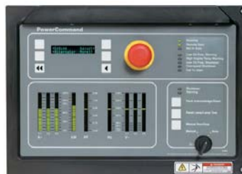
PowerCommand 2100 control operator/display panel